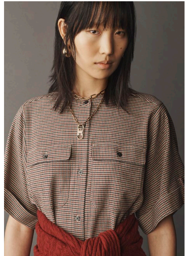
12 / CHECK MIDI SHIRT DRESS Houndstooth Rouge | SOFT WOOL CABLE ROLL-NECK SWEATER Rouge | LUXE LEATHER CROSSOVER Rouge | HARDWARE CLOG BOOT Black