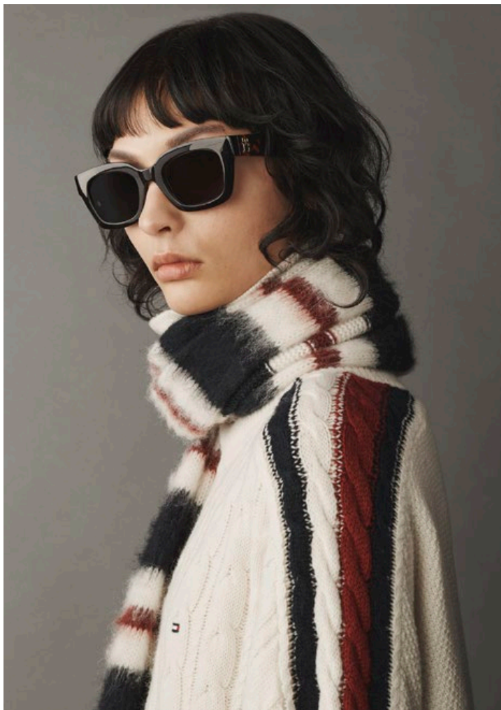
27 / WOOL BLEND PREP CLASSIC PEACOCK Desert Sky | CURVE GLOBAL STRIPE CABLE ROLL-NECK SWEATER Ancient White | LEATHER MIDI WRAP SKIRT Black | FUZZY SCARF STRIPES Aop Global Stripe | FEMININE CROSSOVER Rouge | POINTY KITTEN HEEL SLING BACK Black