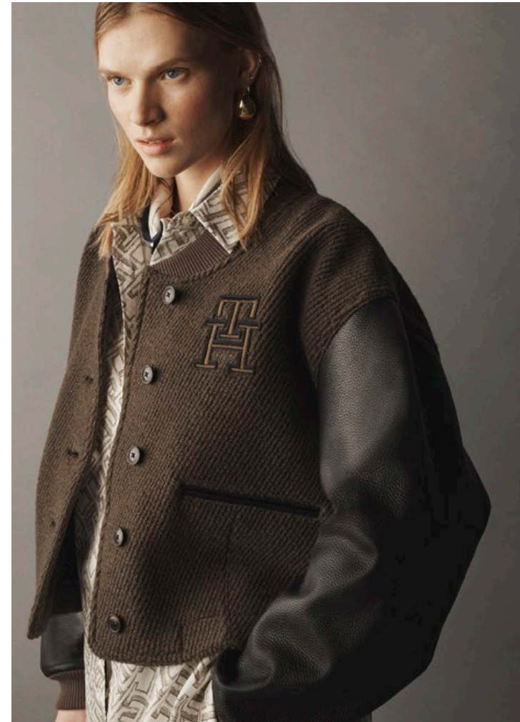
08 / LEATHER WOOL BLEND JACKET Army Green | COTTON LOOSE FIT SHIRT Illustrated Monogram/Ancient White | CORE RELAXED STRAIGHT PANT Desert Sky | TOMMY TWIST SILK & BOX Space Blue Mix | POINTY KITTEN HEEL SLING BACK Black