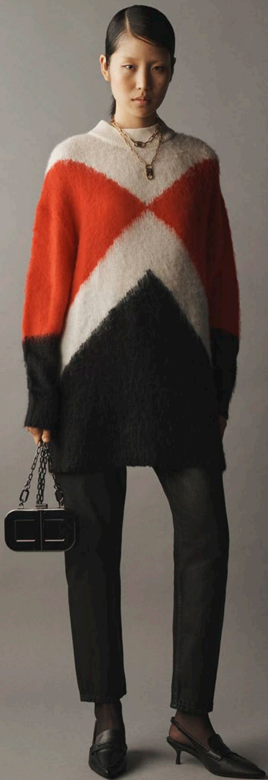
26 / EXPLODED ARGYLE ALPACA SWEATER Argyle Fireworks | LEATHER JOGGER PANT Black | CLUTCH Black | POINTY KITTEN HEEL SLING BACK Black