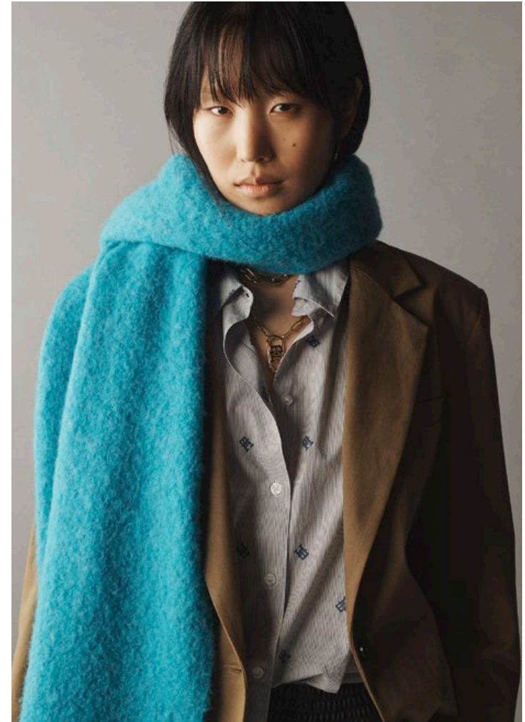
02 / OVERSIZED COTTON BLAZER Sandalwood Brown | ITHAKA STRIPE EASY FIT SHIRT Mini Ithaca Stripe/Twilight Lapis | LEATHER JOGGER PANT Black TOMMY TWIST SCARF Cerulean Aqua | POINTY KITTEN HEEL SLING BACK Black