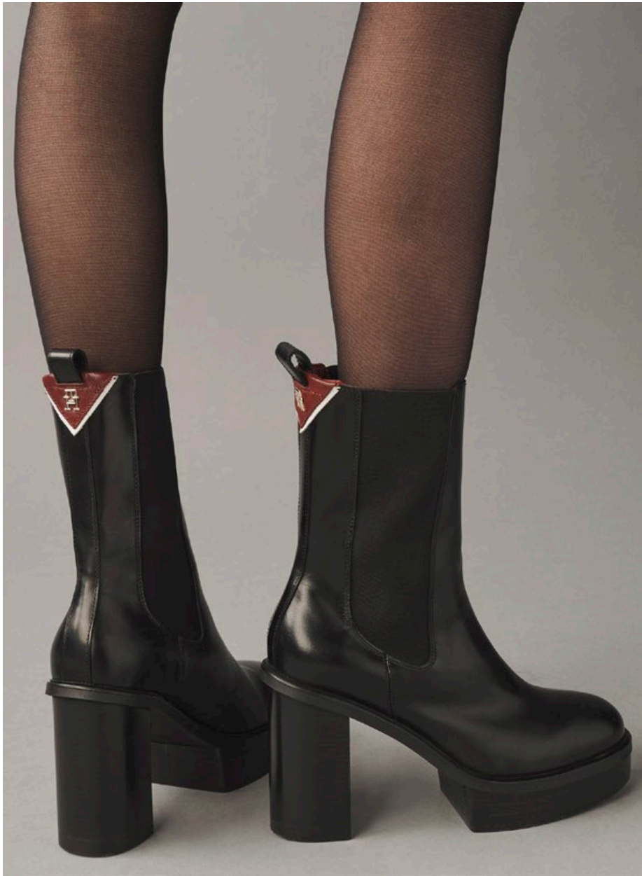
03 / HARDWARE CLOG BOOT Black