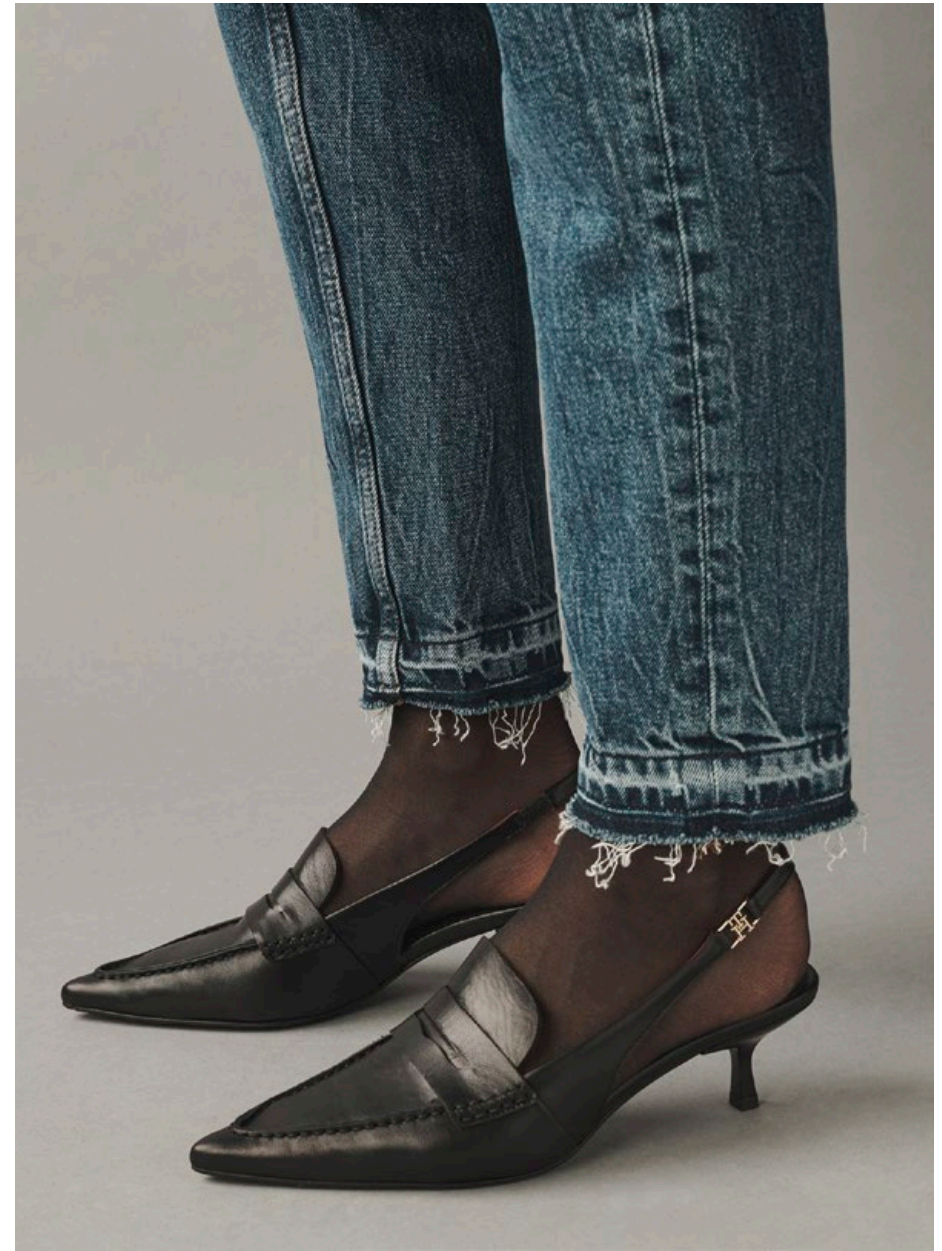
04 / POINTY KITTEN HEEL SLING BACK Black