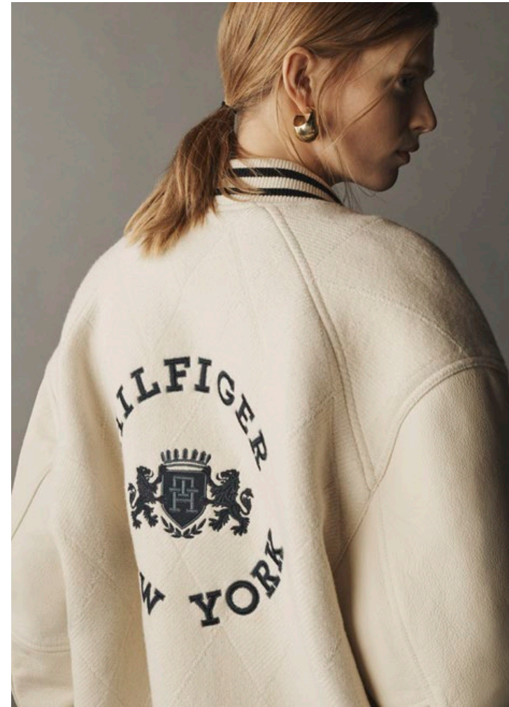
24 / LEATHER ARGYLE VARSITY JACKET Ancient White | ARGYLE COLOR BLOCK SLIP TOP Argyle Fireworks | MATT SHINE TAPERED PANT Black | POINTY KITTEN HEEL SLING BACK Black