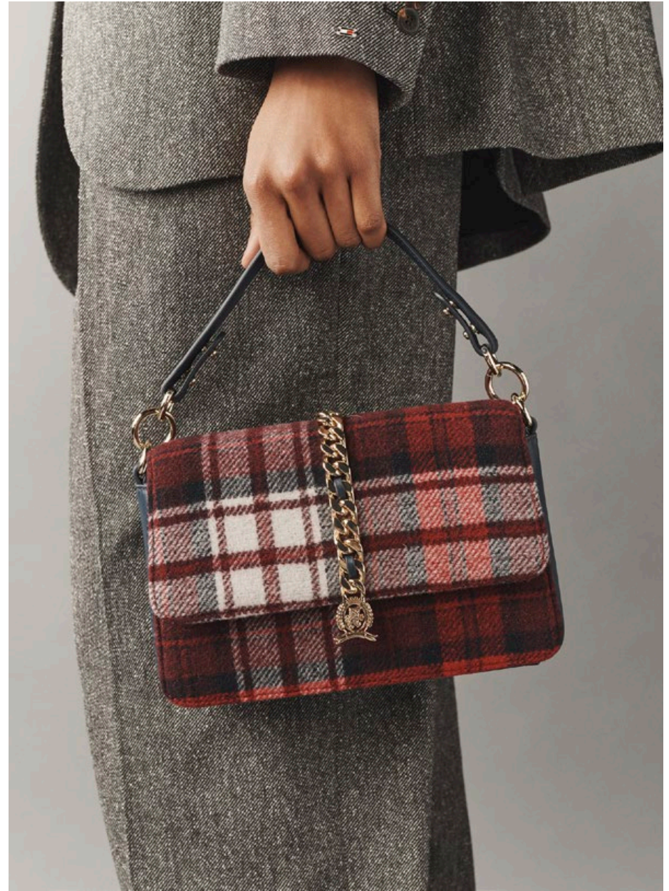
02 / LUXE LEATHER CROSSOVER CHECK Check