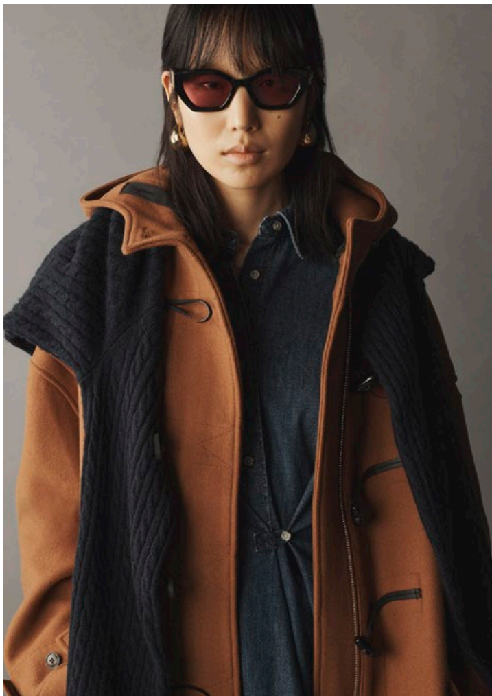
07 / WOOL MAXI DUFFLE Natural Cognac | CURVE SOFT WOOL CABLE V-NECK SWEATER Desert Sky | DENIM LONG SHIRT DRESS Ada | GRAMERCY TAPERED HIGH WAIST JEAN Rue | HARDWARE LOAFER Black