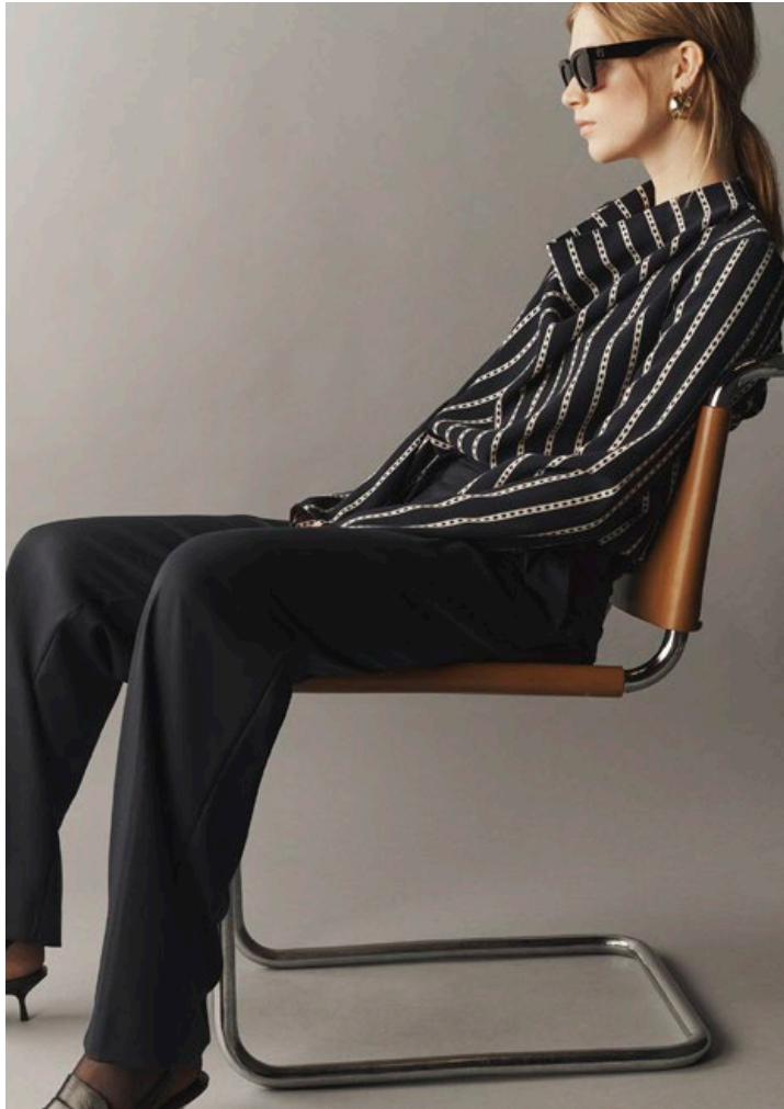
19 / HERITAGE CABLE 1/2 ZIP CARDIGAN Merino | ARGYLE STRIPE COWL NECK BLOUSE Argyle Stripe/Desert Sky | CLASSIC STRAIGHT HIGH WAIST Zia | LUXE LEATHER CAMERA BAG Shearling | POINTY KITTEN HEEL SLING BACK Black