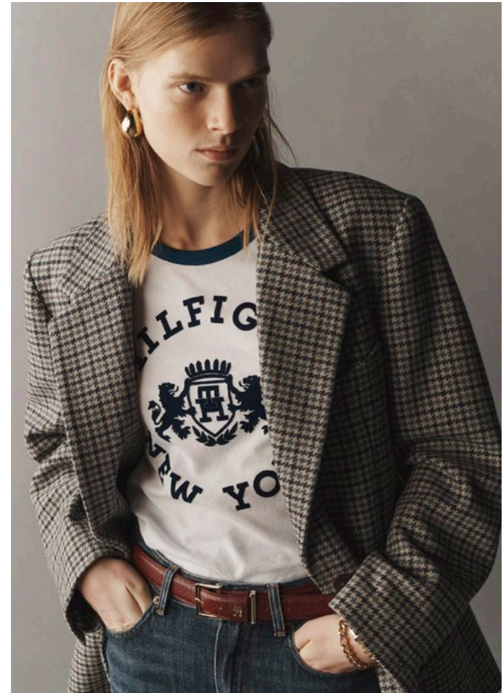
04 / OVERSIZED WOOL CHECK BLAZER Houndstooth Blue Grey | REGULAR VARSITY FLOCK C-NECK Th Optic White | RELAXED STRAIGHT HIGH WAIST JEAN Sau | CREST LEATHER BUCKET Tan | POINTY KITTEN HEEL SLING BACK Black