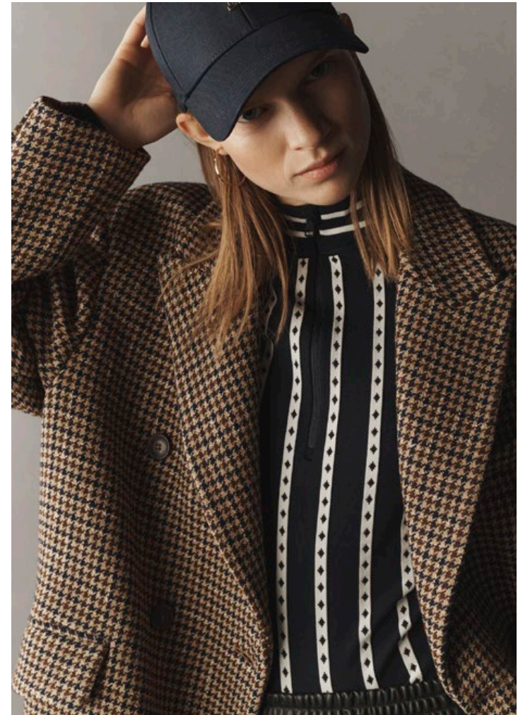
16 / CHECK WOOL BLEND LONG COAT Houndstooth Brown | SLIM ARGYLE HALF ZIP SWEATER Argyle Stripe/Desert Sky | LEATHER JOGGER PANT Black | MONOGRAM CAP Space Blue | LUXE LEATHER MICRO POUCH CHECK Check | HARDWARE LOAFER Black