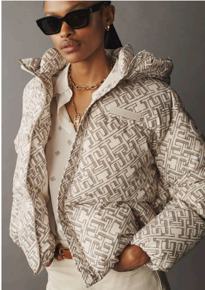
01 / NEW YORK PUFFER JACKET Monogram Allover White | SOFT WOOL CABLE V-NECK SWEATER Natural Cognac | SILK FLUID SHIRT Monogram Critter/Ancient White | BALLOON HIGH WAIST JEAN Ancient White | POINTY KITTEN HEEL SLING BACK Black