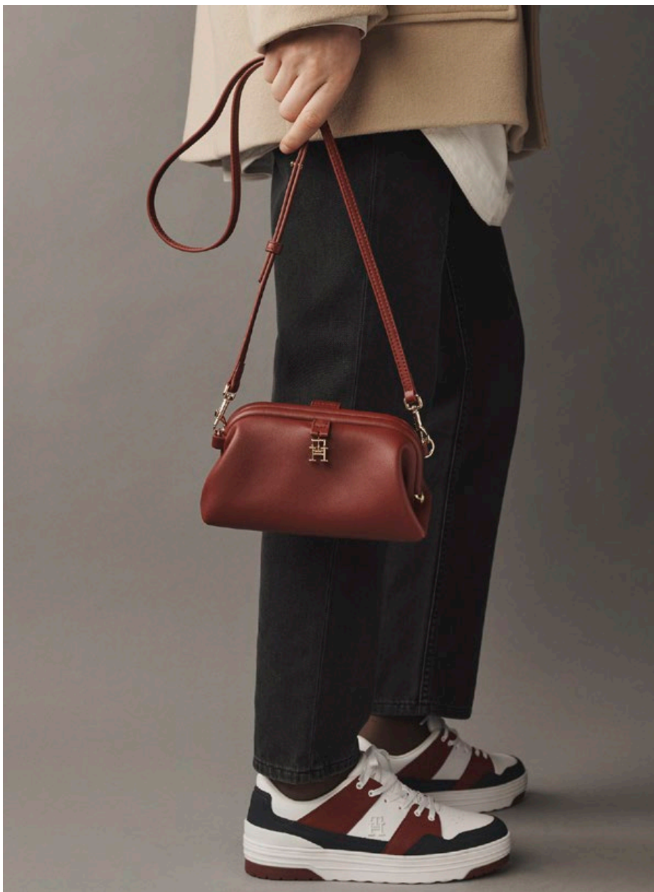
05 / FEMININE CROSSOVER Rouge | LO BASKET SNEAKER Rwb