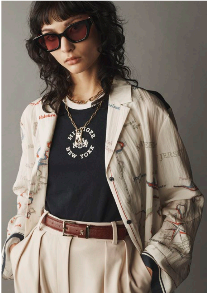
03 / SCARF PRINT FLUID SHIRT Map Scarf/Ancient White | SLIM VARSITY RACERBACK TANK Desert Sky | CORE RELAXED STRAIGHT PANT Cashmere Crème | TOMMY TWIST SCARF Putting Green | PUSHLOCK LEATHER SMALL CROSSOVER Putting Green | LO BASKET SNEAKER Sugarcane