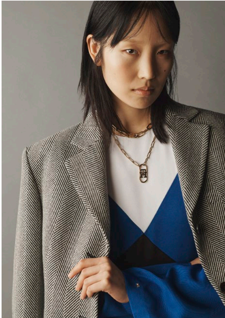
21 / HERRINGBONE OVERSIZED WOOL BLAZER Herringbone | POINTELLE STRIPE DRESS Desert Sky | HARDWARE CLOG BOOT Black