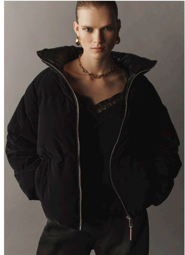
22 / MODERN WAISTED VELVET DOWN JACKET Black | LACE SLIP TOP Black | SLOUCHY BLACK COATED PANT Black Coated | CLUTCH Black | POINTY KITTEN HEEL BOOT Black