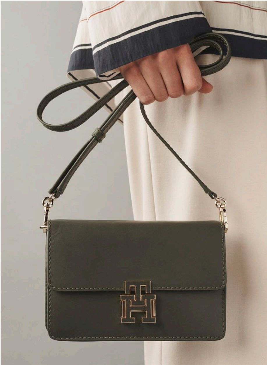
01 / PUSHLOCK LEATHER SMALL CROSSOVER Putting Green