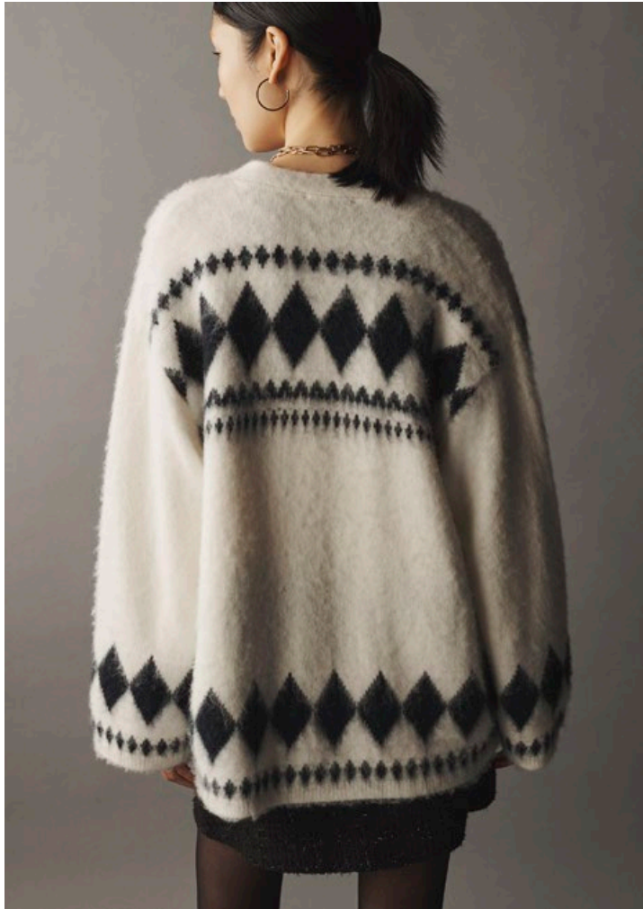
25 / FAIRISLE OVERSIZED V-NECK CARDI Ecrú | FAIRISLE OVERSIZED C-NECK SWEATER Ecrú | TWEED MINI SKIRT Black | LIMITLESS CHIC WOOL SCARF Black | FEMININE CROSSOVER Black | FESTIVE POINTY PUMP Silver