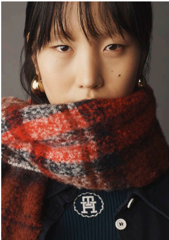
13 / DENIM OVERSIZED SHIRT Bea | RIB TANK TOP Deep Indigo | DENIM LONG MIDI SKIRT ECRU Ecrú | TOMMY CHECK SCARF Space Blue | HARDWARE CLOG BOOT Black